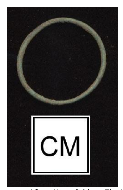
Button ring recovered from West Cabin at The Hermitage

"Ring": These buttons have a cloth or crocheted covering structured around a thin metal ring. The metal ring is often the only part recovered archaeologically. See how to catalog button rings in Section 6.8.